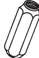
Female to Female